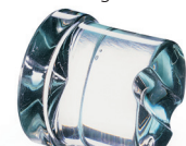
Ø 38 x H 41 mm

This product qualifies for the following listings: