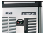
Front ON-OFF Switch