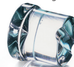
Ø 29 x H 34 mm